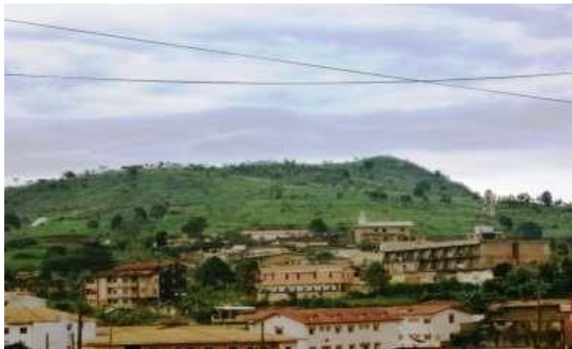
Picture1: the habitat along the slopes of Signal Hill.

From the year 2000, with the intensification of the university, green spaces were increasingly used for the construction of mini-cities (in the Valley, Keleng, Foréké and Azuenla quarters). This is how we see the transition from the type of construction with earth brick to another type of construction modern materials, meeting the requirements of students and teachers of the University.