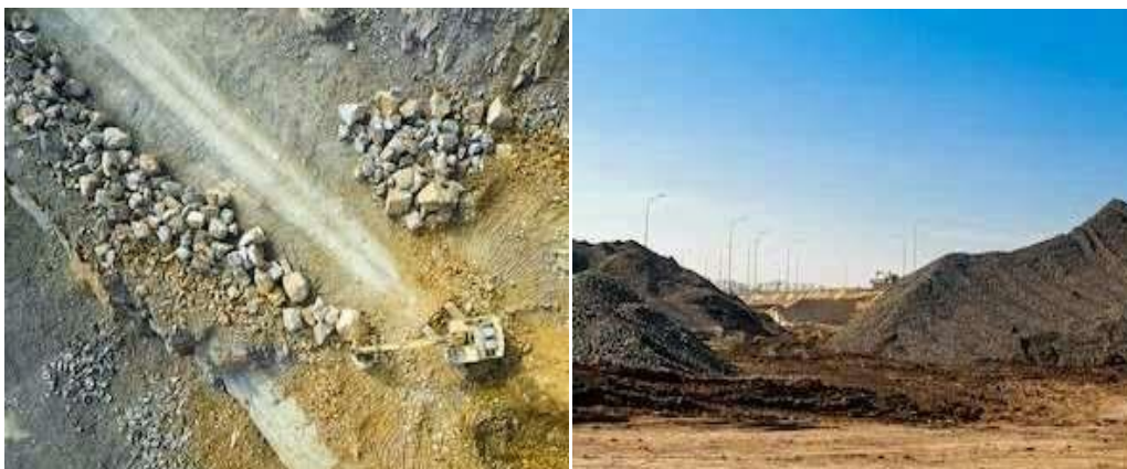
Figure 1: Typical examples of waste rock [6]

Mining operations generate two types of waste rock – overburden and mine development rock. Overburden results from the development of surface mines, while mine development rock is a byproduct of mineral extraction in underground mines. The quantity and composition of waste rock varies greatly from site to site, but these wastes essentially contain the minerals associated with both the ore and host rock. The ratio of overburden excavated to the amount of mineral removed is called the overburden ratio or stripping ratio.