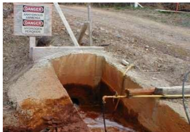
Figure 5: Hydrogen Peroxide Method of Treatment [1]

EPA visited Newmont Gold Company's Rain facility in September of 1991 [1]. The facility is located on approximately 627 acres, 9 miles southeast of Carlin in Elko County, Nevada. Projected waste rock tonnage was estimated to be 41.4 million tons by the end of 1990, and 62.5 million tons during the life of the mine [1]. Following detection of the acid generation in 1991, Newmont's Rain facility Water Pollution Control Permit was revised. As part of the revised Permit, Newmont is required to report quarterly on results of Meteoric Water Mobility testing and Waste Rock Analysis. In response to the drainage, Newmont took the following actions. By May 9 (one day after the drainage was noted), a small pond was constructed to collect the flow from the dump. As a long-term mitigation/prevention measure, Newmont began encapsulating sulfidic waste rock within oxidized and/or calcareous waste rock that has either no net acid generating potential or some acid neutralizing potential [1]. As of late 1991, this was being accomplished by placing a pervious layer of coarse oxidized waste rock on the native soil [1].