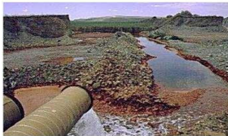
Figure 2: Partially treated mine water from the Grootvlei Dam enters the Blesbokspruit (After 8, 19).

The effect of the contaminated water from the mines can persist for more than 10 km beyond the source [16]. Evidence of AMD was found in the blesbokspruit catchments [17].