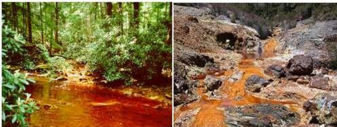
Figure 6: Effect of Acid Mine Drainage from Iron Mountain Mine, California [1]

According to [1], the Iron Mountain Mine is a 4,400-acre NPL site in Shasta County, California, approximately nine miles northwest of the City of Redding. Between 1865 and 1963, the area was used for the mining and processing of copper, silver, gold, zinc, and pyrite [1]. In 1983, Iron Mountain Mine was added to the NPL. Acid mine drainage, leaching from both the underground mine workings and from the tailings piles located at the site, is causing zinc, cadmium, and copper contamination of the Spring Creek Watershed and the Sacramento River. Environmental damage is primarily in the Sacramento River and tributaries in the Spring Creek and Flat Creek watersheds, where fishery productivity loss and periodic fish kills have been observed [1]. Drinking water drawn from the Sacramento River for the City of Redding (population 50,000) is also threatened [20].