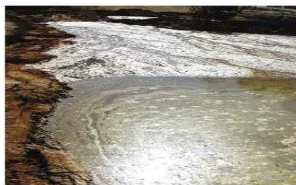
Figure 3: Water pollution in wonderfontienspruit resulting in mine water effluents from nearby stream (After [18, 19]).

5.2 A Case History of Phytoremediation for Reclamation of Abandoned Mine Sites in India The restoration of a dense vegetation cover is the most useful to physically stabilize mine wastes and to reduce metal pollution effects [10]. Different plant species that are well-adapted to the local conditions, capable of excluding and accumulating heavy metals without