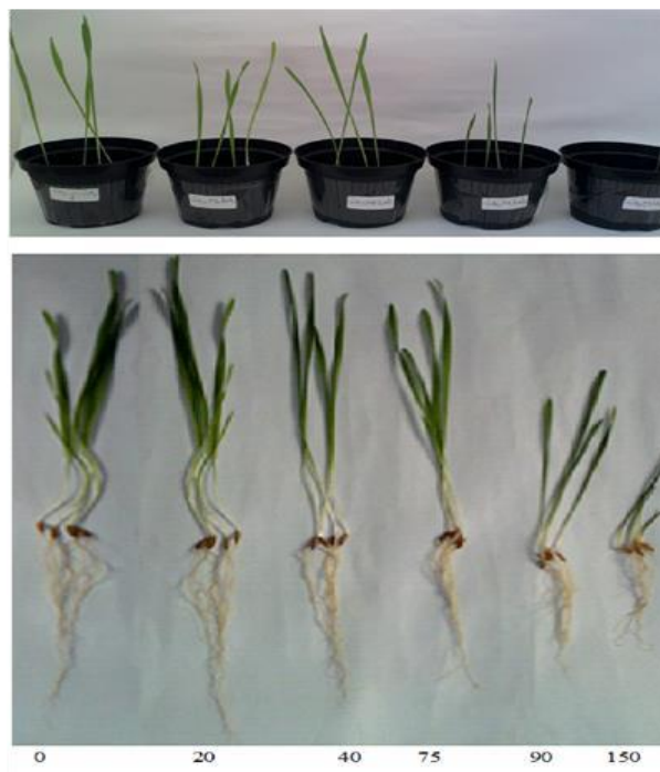
Picture 2: Effect of NaCl effect of concentrations on the lengths of the roots and the shoots of Barley Rihane 03

Analysis of variance of data presented in showed that salt stress had adverse effect on germination and seedling growth of barley , was P\text{-Value}=0.00 . The increase of salt concentration had a negative effect on germination for which the rate decrease, this result has also been reported by several authors Naseer et al. [7], Movafegh [8], Yousofinia [9] and Y. El Goumi[2]. This decrease might be caused by the high osmotic pressure of the solutions slowing down the intake of necessary water for germination and by the toxic effect of high salt concentration on embryo, that high salt concentration inhibits the mobilization of the seed reserves and the growth of embryonic axis [2].