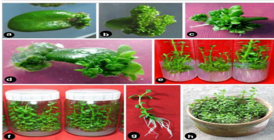
FIG 3 :- Shows Tissue culture of Brahmi plant by Leaf explant

The experiment used small shoots (1.5 - 2 cm) with leaves (0.7 - 0.9 cm length, 0.3 - 0.5 cm width) gathered from healthy vegetatively propagated net house grown plants of five distinct accessions of Bacopa monnieri at the SMVDU Herbal Garden in Katra, Jammu and Kashmir (Latitude = 28°66' North, Longitude = 77°21' East, Altitude = 754m). The leaves were thoroughly washed with tap water, treated with a 2% (w/v) Tween 20 solution, then 1% (v/v) Sodium hypochlorite, and sterilized with a 0.2% (w/v) HgCl 2 solution. The leaves were used as explants to grow cultures on Murashige & Skoog (MS) and Gamborg's (B5) medium, which were autoclaved at 121°C under 15-20 pressure for 15 minutes. Throughout the experiment, the media's pH was kept at 5.8 and gelled with 0.7% (w/v) agar. Explants were injected into culture tubes (15 ml) and put in a culture environment at a temperature of 25 ± 2°C. Cool white fluorescent CFL lights (3000 lux) supplied a 16-hour photoperiod. Five replicates were used for each treatment and accession of Bacopa monnieri , and they were observed for eight weeks, with a four-week subculture interval. Data were gathered weekly, and the experiment was repeated twice [66].