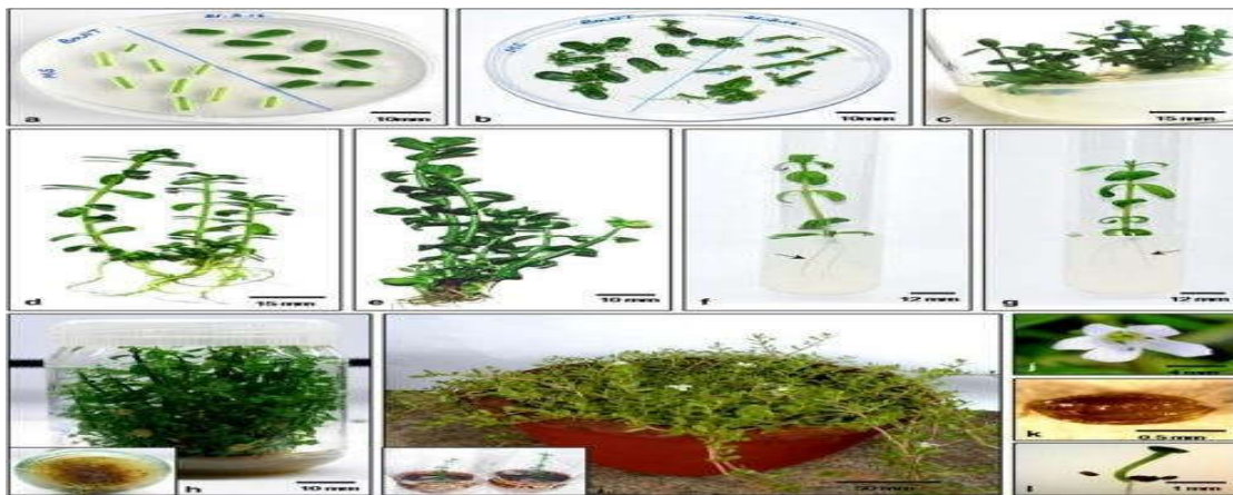
FIG :-1 Shows Tissue culture of Brahmi plant by Shoot explant Result and Discussion

The data were collected in triplicate (n = 3). The analysis consisted of a determination of variances accompanied by a Dunnett numerous comparing test (comparing all versus control) with Prism statistical software. A regression analysis was performed to link the antioxidant potential values acquired using various approaches, and the correlation coefficients were then derived.