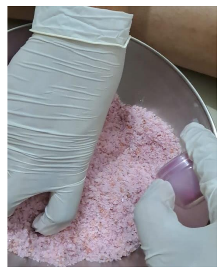
Fig. 5: In-Process manufacturing (Self)