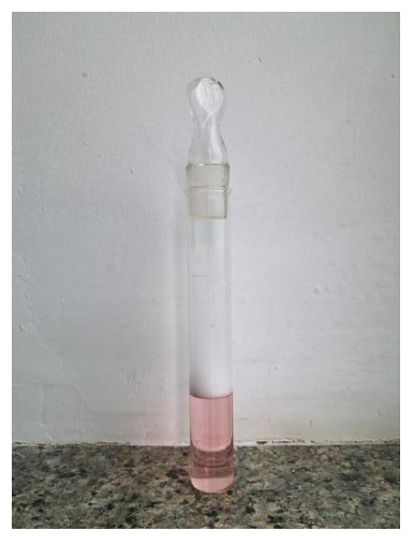
Fig. 6: Determination of Foam Height (Self)

Result- This bath salt produces a nice amount of foam. The foam height of the solution of bath salt and water recorded is 132 mm.