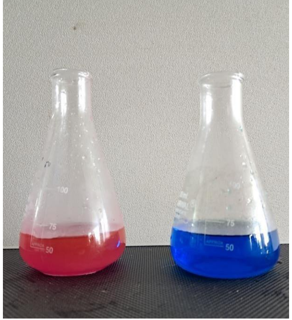
Fig. 7: Determination of Hardness of Water (Self)

Result- This bath salt decently reduces the surface tension of water and reduces its hardness.