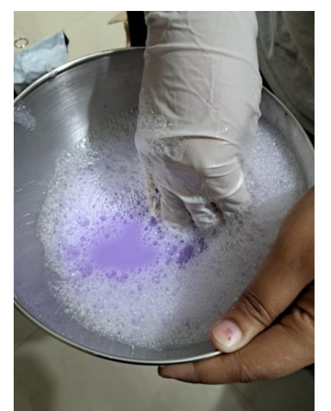
Fig. 3: Foam Produced by Bath Salt (Self)

a) Foaming bath salt- Foaming bath salt produces a decent amount of foam when dissolved in water. The main ingredients due to which the foam is produced are surfactants and foam boosters. Surfactants are ingredients that reduces the surface tension of water and produces foam when contacts water. Surfactants are also good cleansing and wetting agents, that is, they do not only produce foam but also have cleansing properties. Foaming bath salts contains liquid surfactants because of which the manufacturing process of this type of bath salts are different and lengthy.