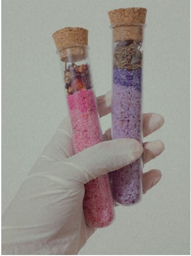
Fig. 8: Airtight Glass Test-Tube Packaging (Self)