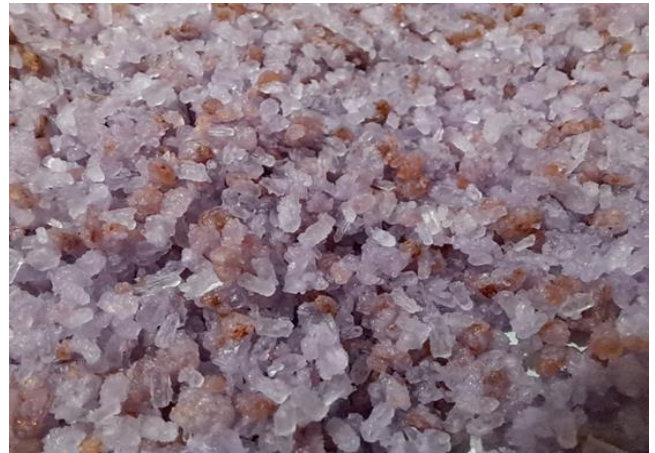
Fig. 2: Crystals of Epsom Salt & Himalayan Pink Salt (Self)

Types : As we know that bath salts serves various functions which are described in the above lines. Some bath salts are added to water to give water a pleasant smell and color. But on the other hand, some bath salts are present in the market which contains foaming agents and surfactants to increase the foaming capacity of bath salts. They are not only classified based on foaming and non-foaming bath salts, but also based on their manufacturing process and ingredients used for therapeutic purposes.