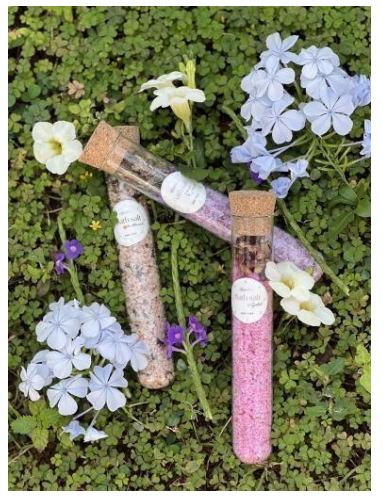
Fig. 1: Final Product

Bath salts are water-soluble, salts that are added to water to be used for bathing. They are said to improve cleansing, enhance the experience of bathing, and gives an aesthetic feel. Bath salts convert hard water into soft water i.e., it reduces the hardness of water and helps other liquid soap to dissolve in the water. Some bath salts have glycerin so that it will function as a humectant.